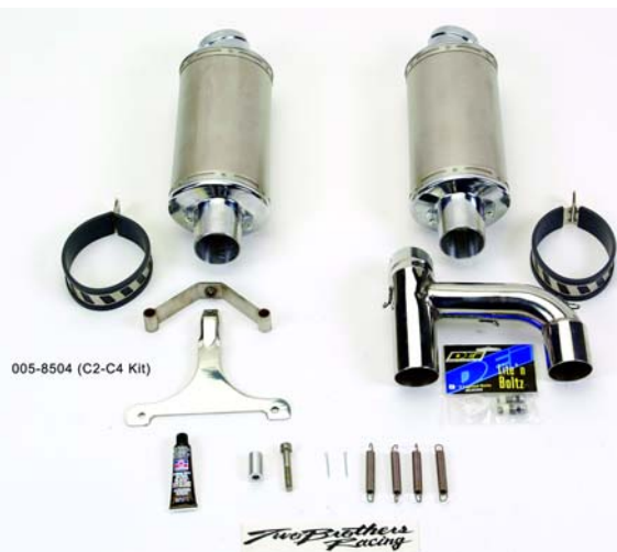
005-8504 (C2-C4 Kit)