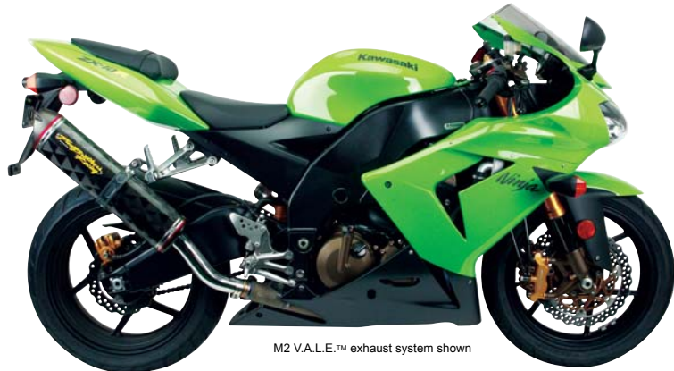
M2 V.A.L.E.™ exhaust system shown