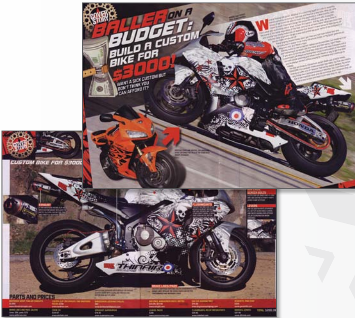
Super StreetBike Magazine Editorial (April) Cover story: Build a Custom Bike for $3000. Check it out on pages 54-61.