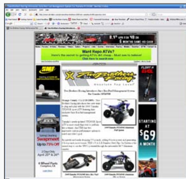
atvriders.com Press Release New Products: 2009 Yamaha YFZ450R M7 exhausts system and Plug and Play Juice Box.