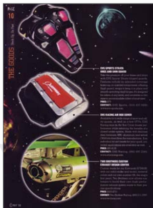
ATV Sport Magazine Editorial (May) Exhaust Design Center: Check it out on page 10.