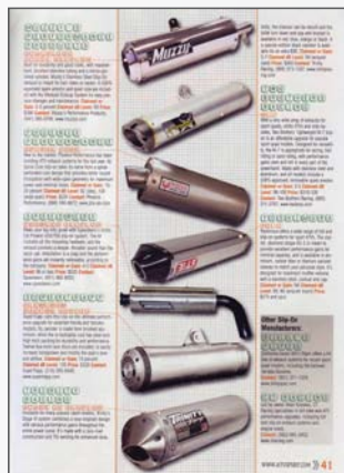
ATV Sport Magazine Editorial (May) Plug and Play: Check it out on page 41.