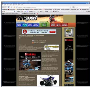
atvsport.com Press Release New Products: 2009 Yamaha YFZ450R M7 exhausts system.