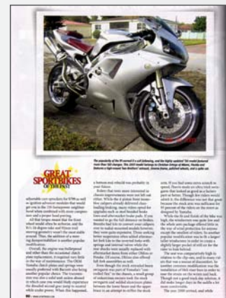
SportRider Magazine Editorial (May) Great Sportbikes: Check it out on page 90.