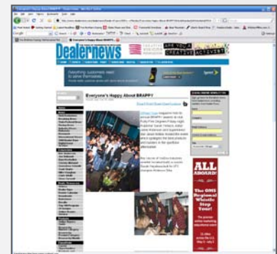
dealernews.com Press Release 2Wheeler Tuner Brappy awards: TBR won Best Custom Product!