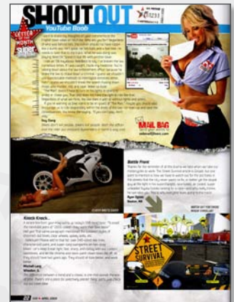
SuperStreetBike Mag. Editorial (April) Shout Out: Knock, Knock Check it out on page 22.